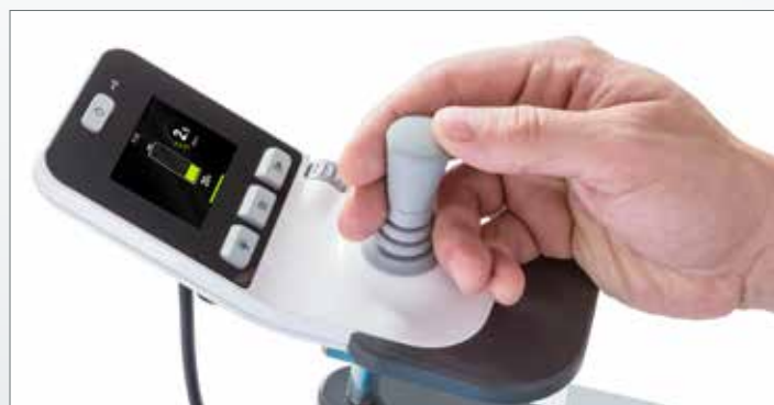
Informative colour display and user-friendly control elements