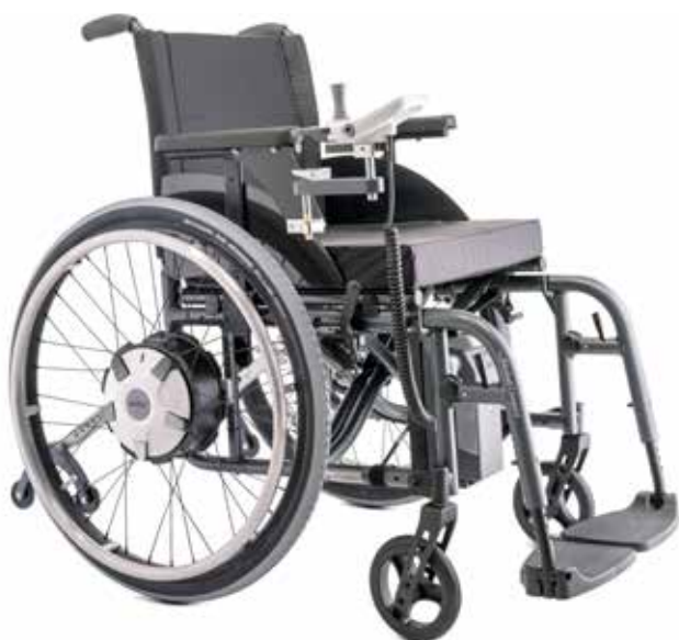
e-fix E36: powerful drive wheels with more power (optional)

Thanks to the EasyConnex magnetic plug system, the control unit and battery charger are easy to connect. The automatic contacting of the battery in the innovative battery mount is especially helpful during everyday use.