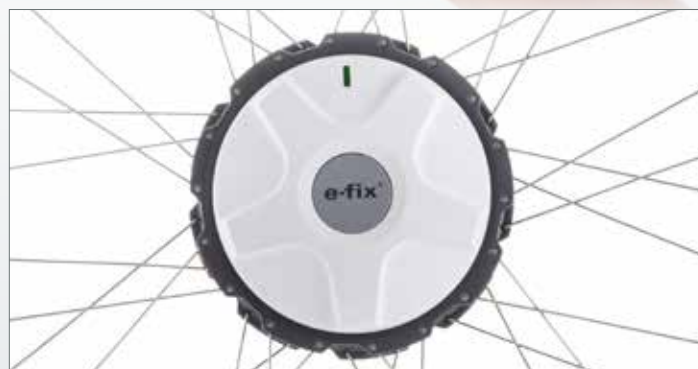
Compact, light, powerful: the e-fix drive unit